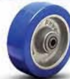
Urethane on Aluminum