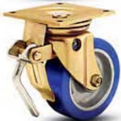
Total Lock Brake Add [TLB] at end of model.