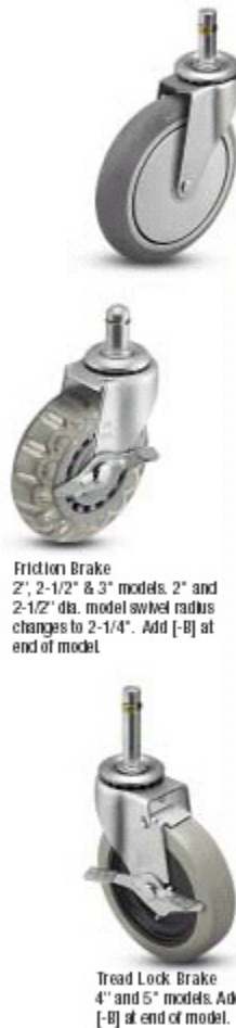
Friction Brake 2", 2-1/2" & 3" models. 2" and 2-1/2" dia. model swivel radius changes to 2-1/4". Add [-B] at end of model.